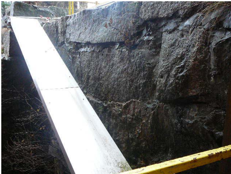
Upstream eel passage