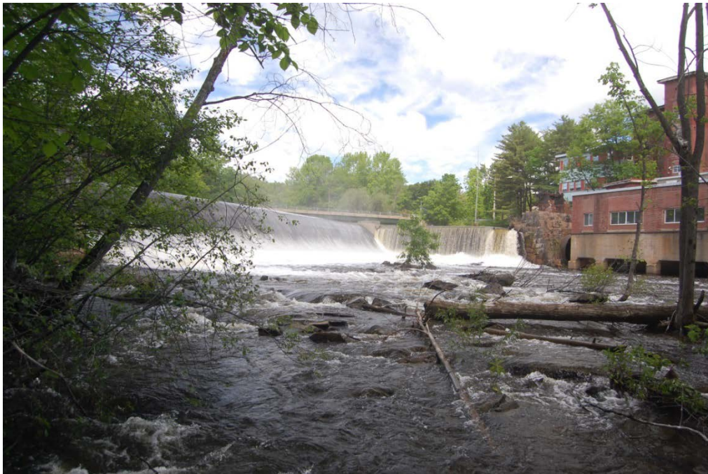
Spillway and Bypass