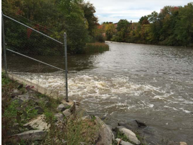
Exhibit #2 - Photographs of Zone of Effect No. 1 – Project Tailwater