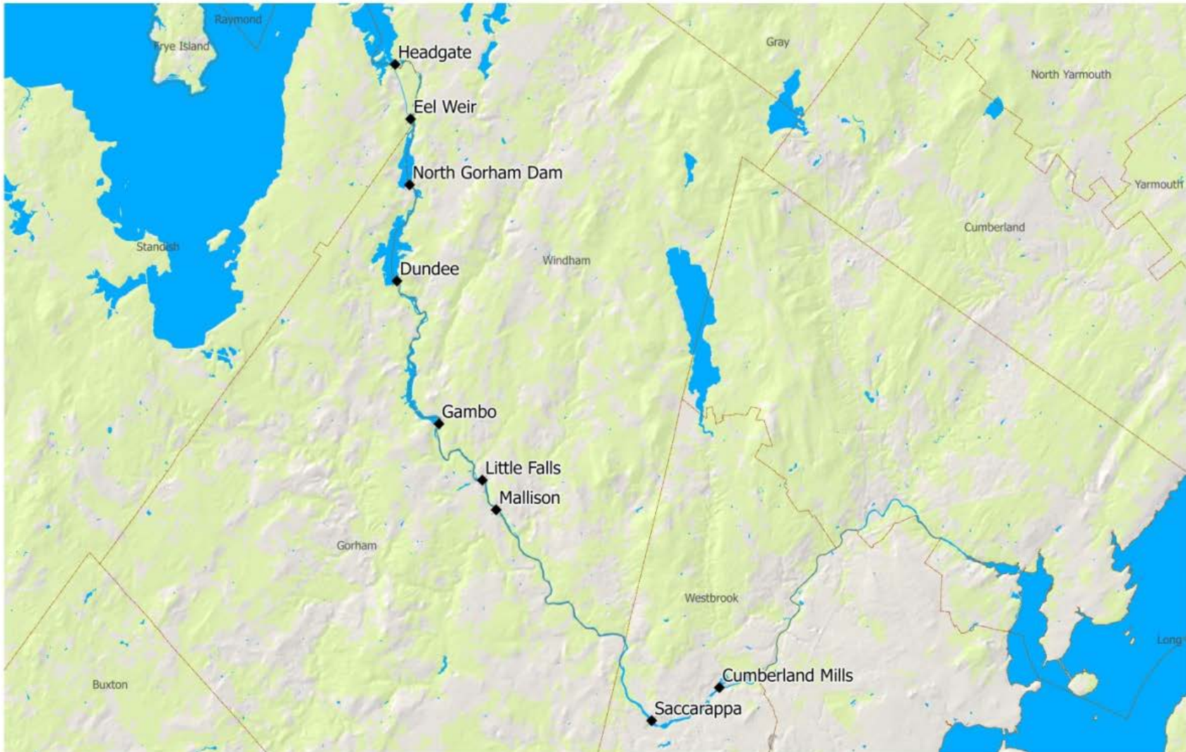
Fig. 1 – Dams located on the Presumpscot River