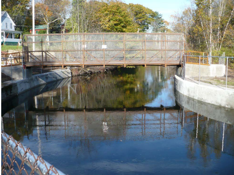
Canal with pedestrian bridge providing access to the bypass reach