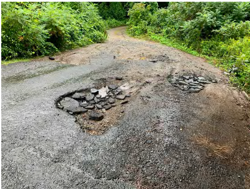
Photo 1: Steep, eroded section at access road entrance, close to Rt 2. Part of parcel 6