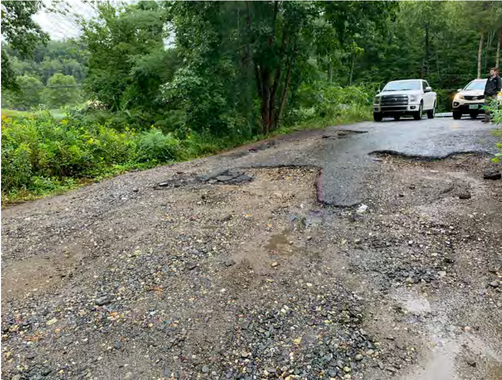
Photo 3: View of eroded area, view north towards Rt 2. Part of parcel 6