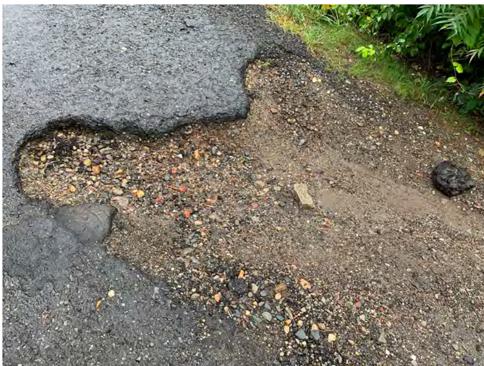
Photo 2: Detail of steep, eroded road section near Rt 2. Part of parcel 6