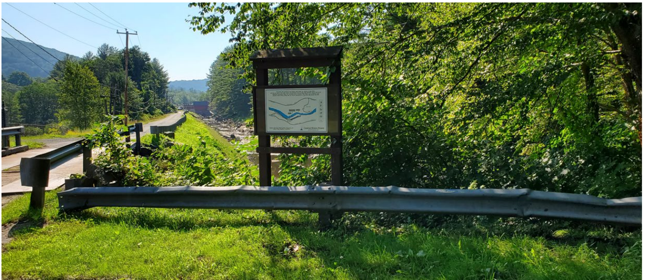
Photograph of installed public-info sign at Buckland canal trailhead.