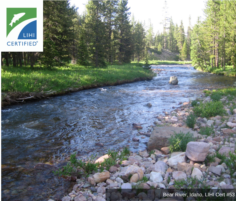
Bear River, Idaho, LIHI Cert #53