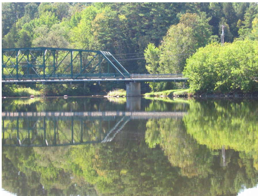
Canoe takeout upstream of Passumpsic Station

Central Vermont Public Service Corp. 77 Grove St. Rutland, VT 05701