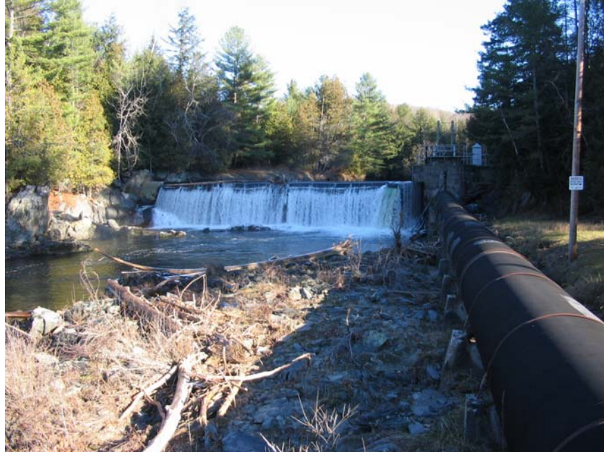
Figure 3 - Pierce Mills Dam

A 6-foot diameter, 246 foot-long wood stave conveys flows from the dam to the powerhouse with a drop in elevation of 18 feet. The powerhouse contains one vertical shaft turbine rated at 271 kilowatts (kW). The Project also includes a substation, and a downstream fish passage facility located in the spillway adjacent to the intake. The bypassed reach at Pierce Mills is about 330 feet long. The Project has an average annual generation of about 1,337 megawatt-hours.