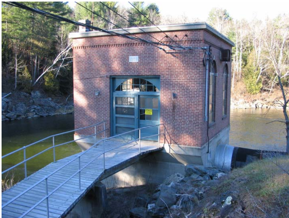
Figure 4 - Pierce Mills Powerhouse

A 6-foot diameter, 246 foot-long wood stave conveys flows from the dam to the powerhouse with a drop in elevation of 18 feet. The powerhouse contains one vertical shaft turbine rated at 271 kilowatts (kW). The Project also includes a substation, and a downstream fish passage facility located in the spillway adjacent to the intake. The bypassed reach at Pierce Mills is about 330 feet long. The Project has an average annual generation of about 1,337 megawatt-hours.