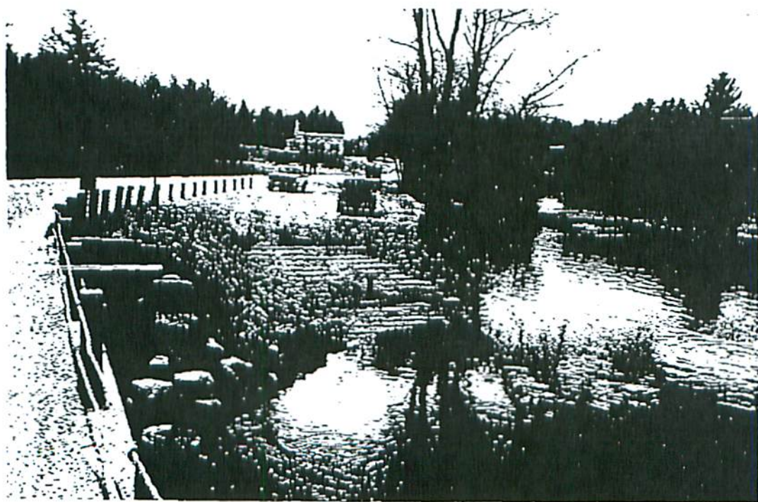
View of Launch Site from Bridge