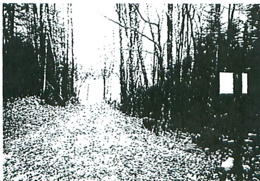
View of Take-Out