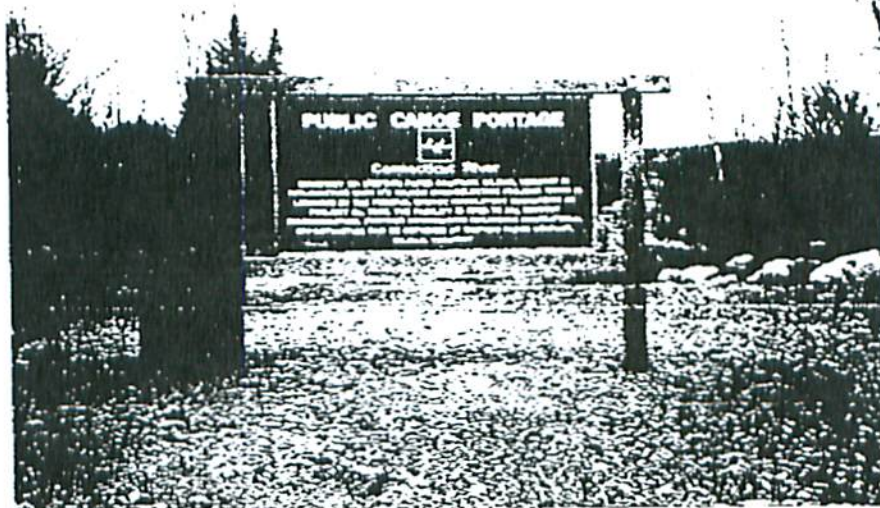
Canoe Portage Sign