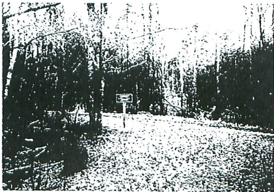
Portage Directional Sign