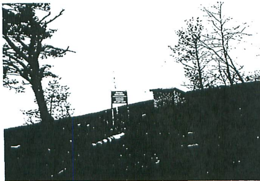
Directional Sign on Right River Bank