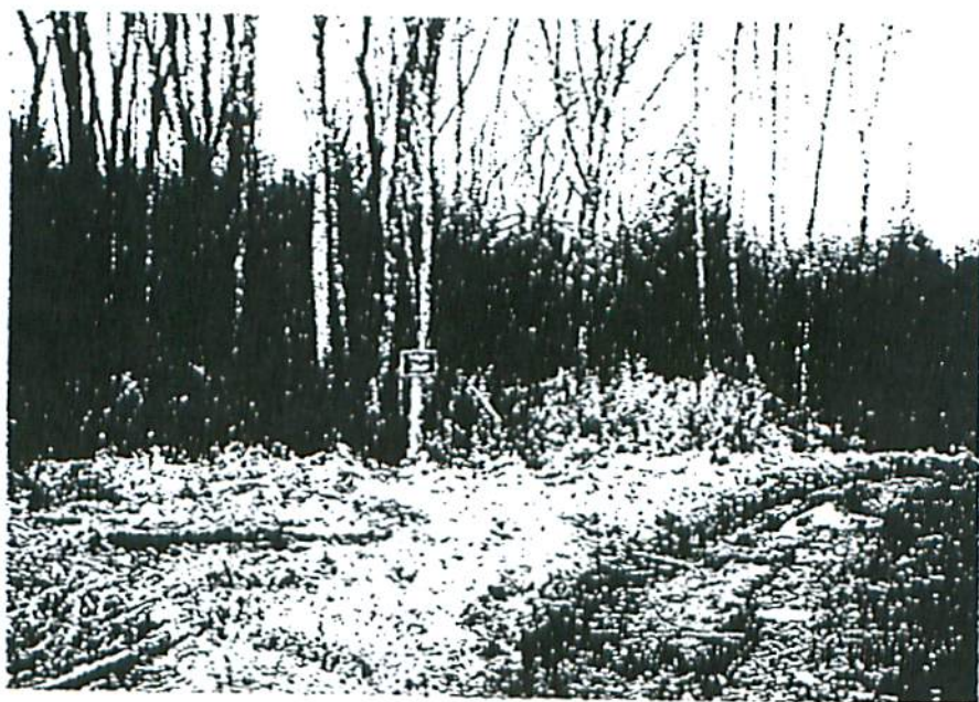
Portage Directional Sign