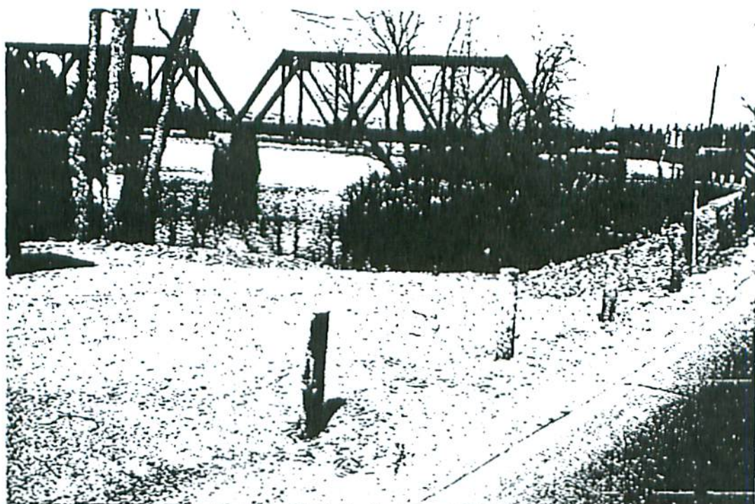
View of Launch Site from Parking Area