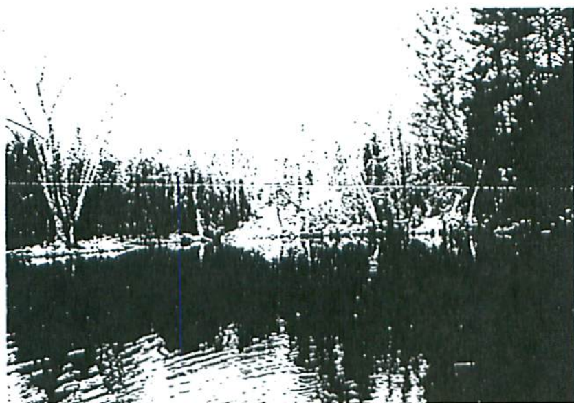
Upstream View of Canoe Take-Out