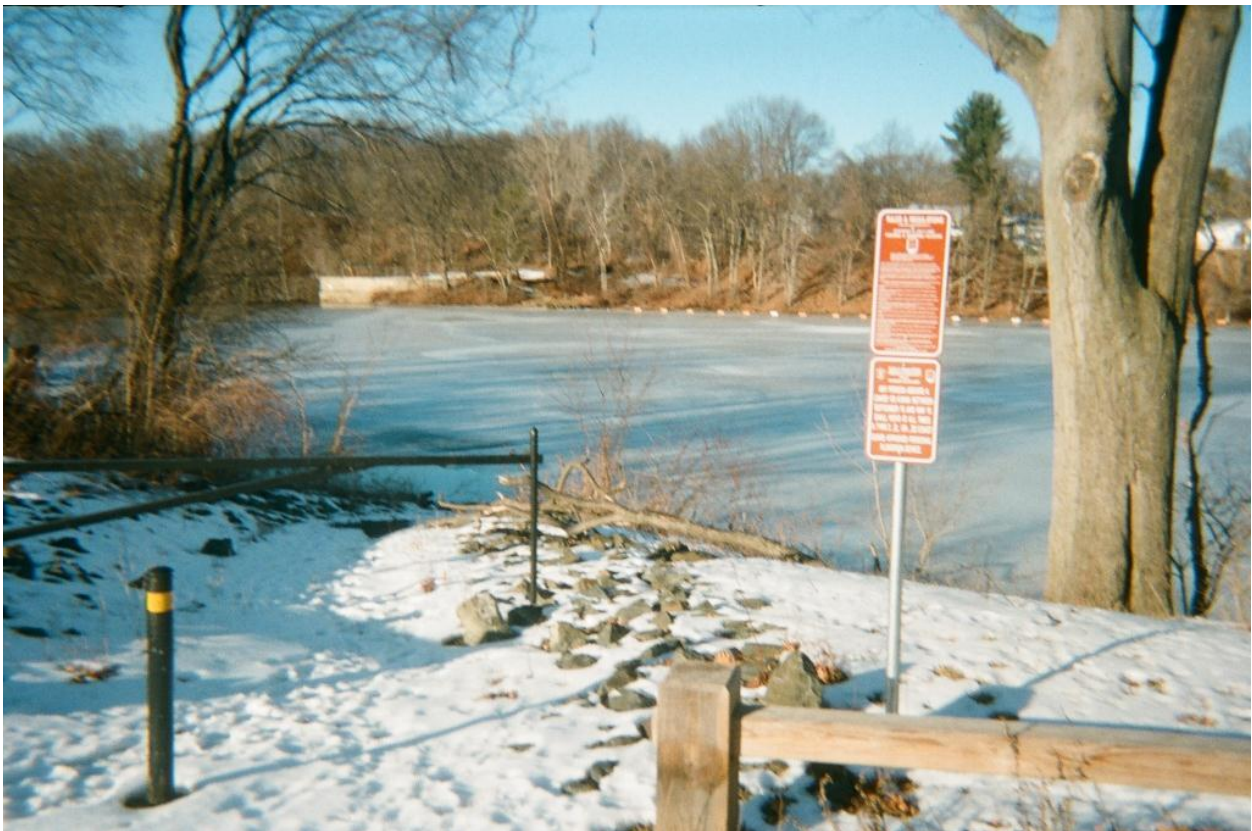
Looking down the Chicopee River from the City of Springfield Boat Ramp and Picnic Area

A map of the Existing Recreational Facilities at the Indian Orchard Project may be found on the portion of the LIHI website devoted to the Indian Orchard application and is titled “Existing Recreational Facilities at the Indian Orchard Project.”