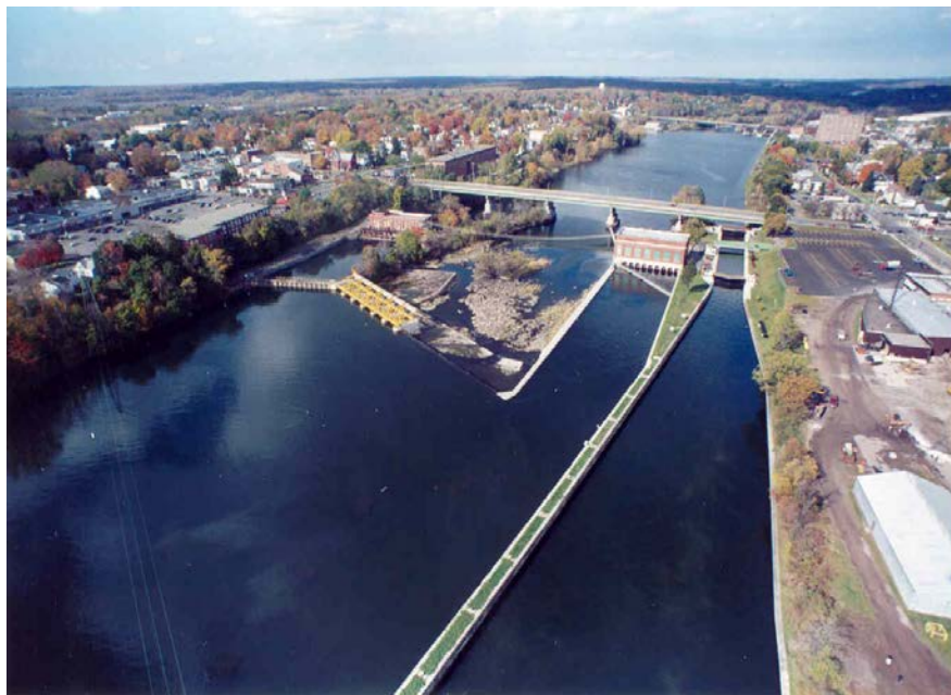
Figure 2 – View Looking downstream at the Oswego Falls East (right) and Oswego Falls West (left) Developments at Upper Fulton Dam/Lock 2.