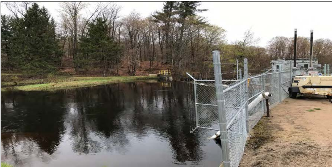
Figure 2 - Looking Downstream at Spillway and Water Intake

The Project dam is located at RM 28.8 on the Salmon River near the Town of Malone in Franklin County, New York (Latitude 44.746° N, Longitude 74.223° W). The Project was originally constructed in 1913 for the sole purpose of energy production and consists of a dam with an integrated spillway and water intake (Figure 2), a pipeline (Figure 3), a powerhouse and the tailrace.