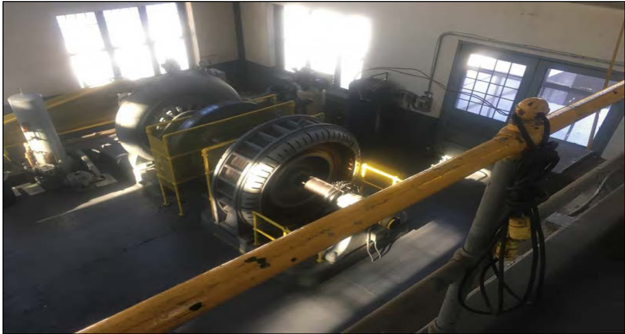
Figure 6 - View of Francis Turbine/Generator

There are currently no plans for turbine or generator upgrades in the near future.