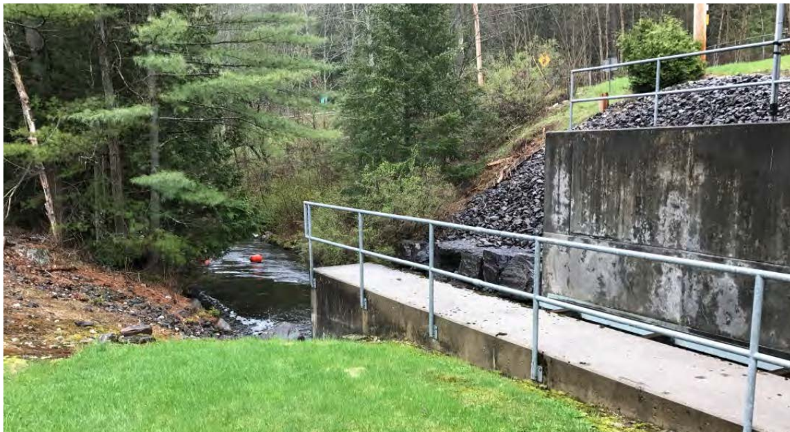
Figure 5 - Project's Tailrace

The powerhouse contains three S. Morgan Smith horizontal Francis turbines. A view of one of the Francis turbine/generators is shown in Figure 6 . Turbines 1 and 2 have a design output capacity of 1.31 MW at a design head of 256 feet and a speed of 120 revolutions per minute (rpm). Turbine 3 has a design output capacity of 1.63 MW at a design head of 256 feet and a speed of 120 rpm.