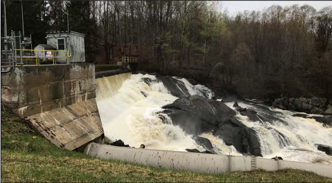
Figure 3 - Looking Cross Channel at Pipeline and Bypass Reach Immediately Below Spillway

The 7-foot-diameter welded steel penstock conveys water from the impoundment's intake 3,355 feet to a transitional pipe manifold just above the powerhouse. The water intake has trashracks with 1-inch clear spacing on a year-round basis. The penstock is above ground for the first 100 feet downstream of the intake, then buried thereafter (Figure 4). The transitional pipe manifold is a 6-foot-diameter steel pipeline guiding flow to the powerhouse turbines.