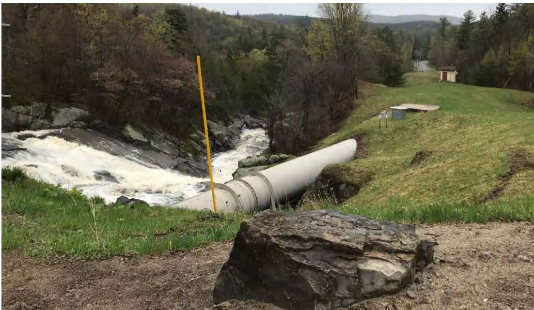
Figure 4 - Looking Downstream at Bypass and Penstock Entering Ground

The 7-foot-diameter welded steel penstock conveys water from the impoundment's intake 3,355 feet to a transitional pipe manifold just above the powerhouse. The water intake has trashracks with 1-inch clear spacing on a year-round basis. The penstock is above ground for the first 100 feet downstream of the intake, then buried thereafter (Figure 4). The transitional pipe manifold is a 6-foot-diameter steel pipeline guiding flow to the powerhouse turbines.