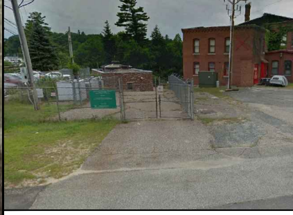
RIVER BEND POWERHOUSE