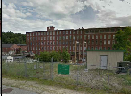
BOW STREET POWERHOUSE