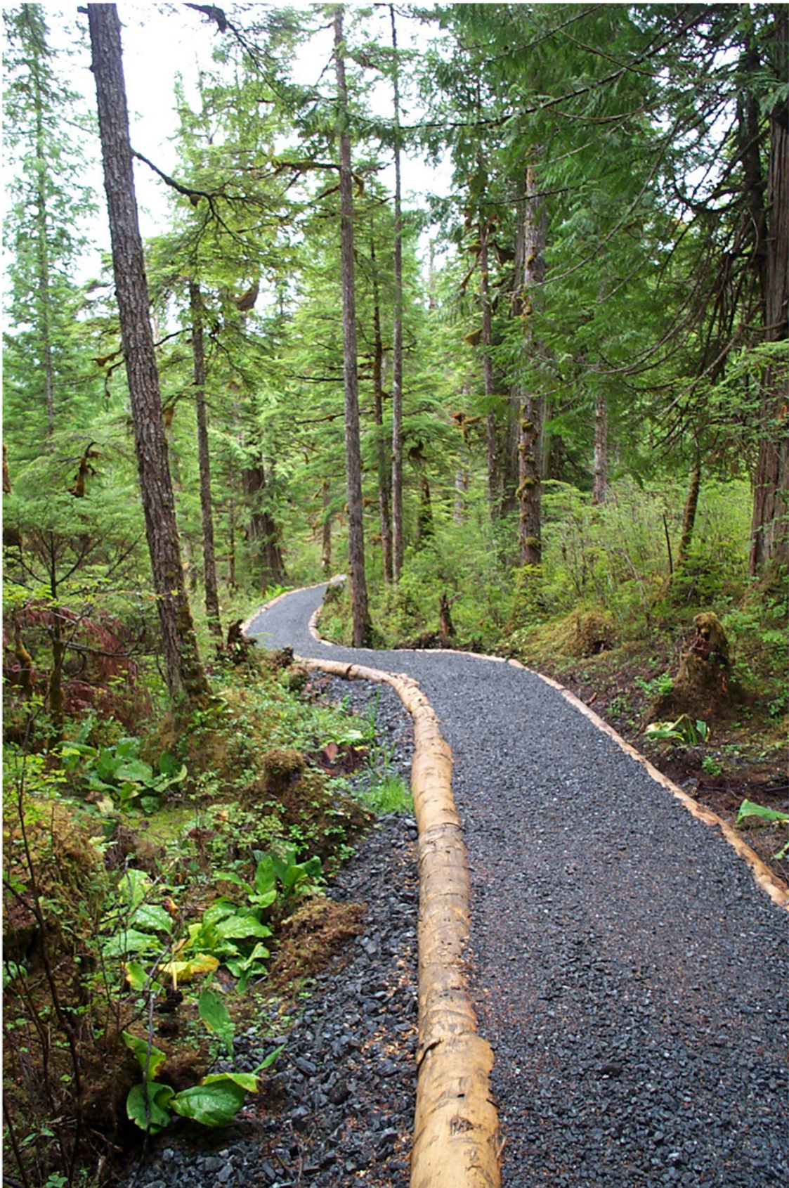
EXAMPLE OF TRAIL TO BE CONSTRUCTED TO REACH THE CABIN SITE