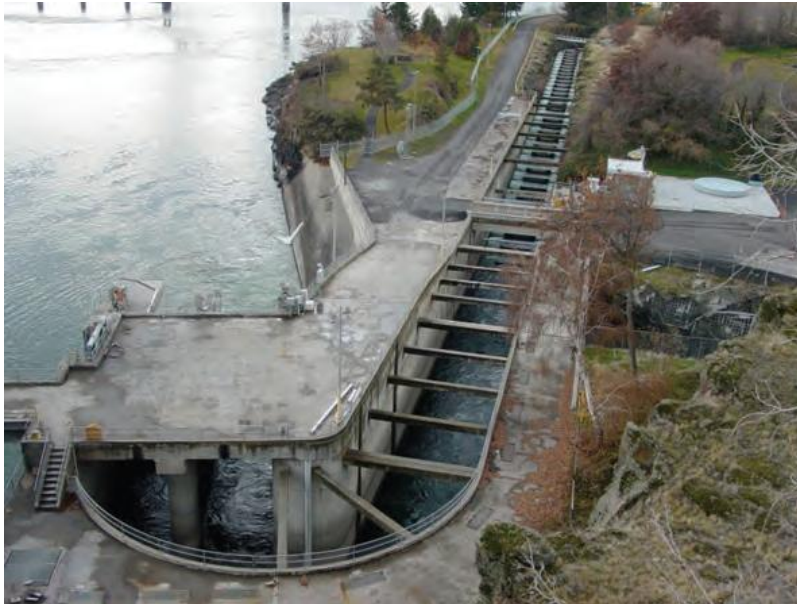
Figure 5. Lower end of the North Fishway. PUD powerhouse on right.

A 10-foot diameter, 85-foot long penstock carries generation flows from the intake structure to the powerhouse, which is situated adjacent to the lower end of the fishway as shown in Figure 5. The station has produced about 40,000 MWh of electricity annually.