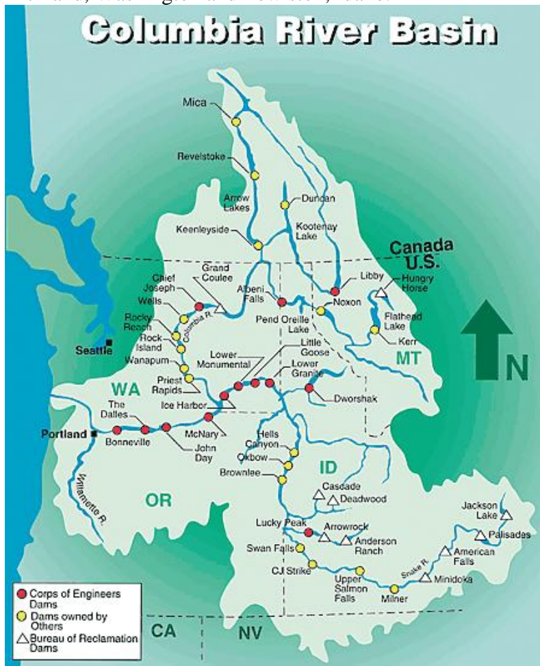
Figure 2. Columbia River Basin dam development.

On December 31, 1987, the Federal Energy Regulatory Commission (FERC) granted a license to the PUD for development of a 4.2 MW North Shore Fishway facility co-located at the Corps' The Dalles Dam. 2 Part of the Columbia River System, The Dalles Dam is the second mainstem dam on the Columbia River 191.5 miles upriver from the ocean. Bonneville Dam is located 45.4 miles downstream, and that dam's backwater (Lake Bonneville) 3 extends to The Dalles Dam. Completed in 1937, Bonneville was first in time, followed later by The Dalles Dam in 1957. The main stem of the Columbia River now supports 14 dams, of which three are in Canada and 11 in the United States. The four lower mainstem dams on the Columbia River (Bonneville, The Dalles, John Day, and McNary) and the four lower dams on the Snake River, a major tributary, incorporate navigation locks to allow ship and barge traffic from the ocean upriver as far as Richland, Washington and Lewiston, Idaho.