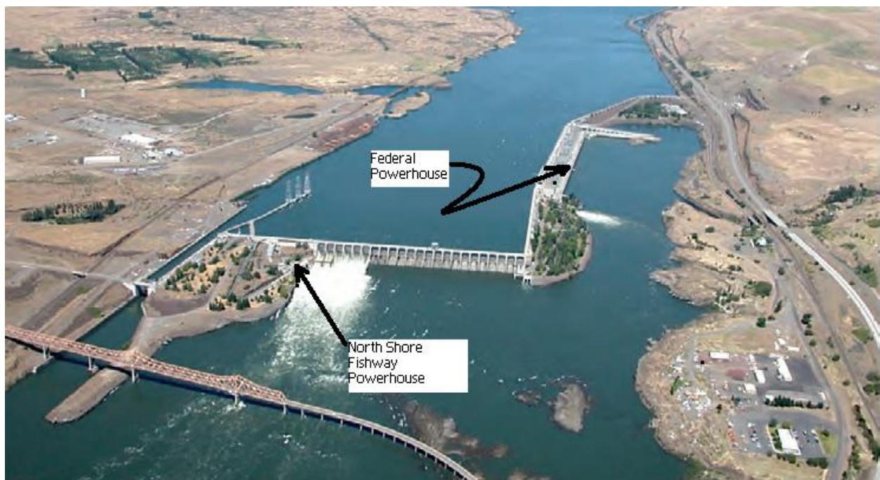
Figure 6. The Dalles Dam looking east. Features starting at north end: Lock, North Fishway, spillway bays, ice and trash sluiceway discharge, federal powerhouse, and East Fishway.

A 10-foot diameter, 85-foot long penstock carries generation flows from the intake structure to the powerhouse, which is situated adjacent to the lower end of the fishway as shown in Figure 5. The station has produced about 40,000 MWh of electricity annually.