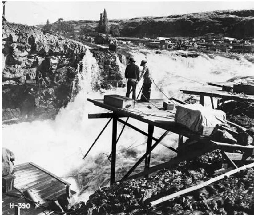
Figure 1. Native Americans precariously tethered to shore while fishing in 1951 at Celilo Falls, now flooded by The Dalles Dam.

This report provides review findings and recommendations related to the application submitted to the Low Impact Hydropower Institute (LIHI) by the Northern Wasco County People's Utility District (PUD) for Low Impact Hydropower Certification of the applicant's small hydroelectric facility which is co-located at the U.S. Army Corps of Engineers' (ACOE) The Dalles Dam, a large scale dam on the lower Columbia River in southwestern Washington state. As licensed, the applicant's project is named The Dalles Dam North Fishway Hydroelectric Project (FERC Project No. 7076) 1 ; however, the applicant refers to it as the North Shore Fishway Hydroelectric Project, and that name is generally used in this report. The LIHI application was deemed complete and publicly noticed on July 17, 2010. No comments were received.