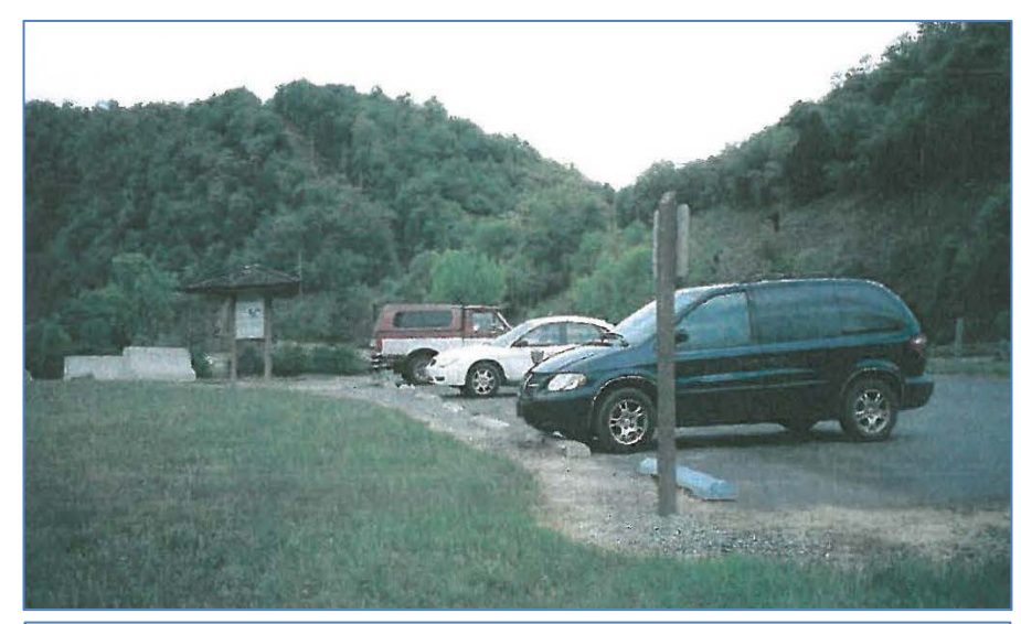
Throughout the prior LIHI Figure 5 - Tailrace Fishing Parking Area

We currently manage Raystown Lake as a two story fishery with both cold-water and warmwater game fish at different depths. We recognize the presence and value of a warmwater fishery in the Raystown Branch and Juniata Rivers and we are currently managing the area downstream of the hydroelectric facility for this purpose.