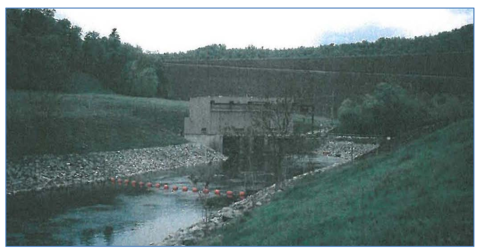
Figure 4 - Tailrace Fishing Area (Looking Upstream).

The fishing area pier is accessible without fees or charges. In addition, the Corps provides a variety of day-use and overnight recreational facilities around the 118-mile reservoir shoreline, along with recreational facilities on the downstream reach. These facilities are accessible without fee or at a nominal fee.