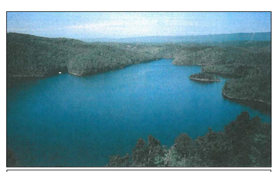
Figure 3 - Raystown Lake Looking SW from Ridenour Overlook

The overflow section is cut through rock at an elevation of 812.0 mean sea level (MSL), and has a crest length of 1,630-feet in the spur of Terrace Mountain.