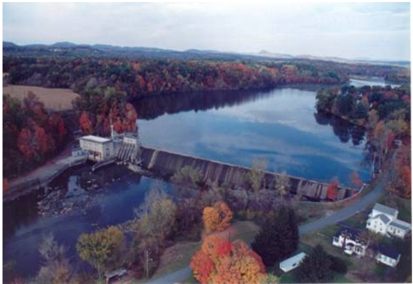
Figure 2 - Johnsonville Dam and Powerhouse