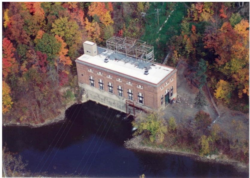
Figure 4 - Schaghticoke Powerhouse