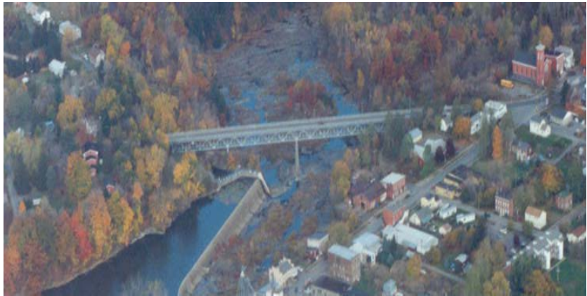
Figure 3 - Schaghticoke Spillway and Canal