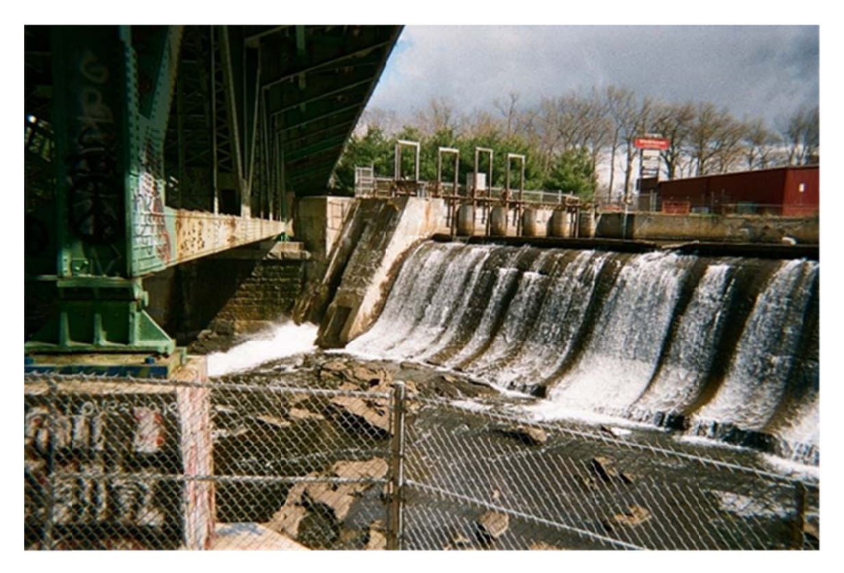
Putts Bridge Spillway, Skimming Gate and Head Gates

The existing major project works include a dam with a crest elevation of 203.6 feet (NGVD), an impoundment, a concrete headgate structure, two conduits, forebay, trashrack, intake structure, a powerhouse with two generating units, a tailrace channel (normal tailrace elevations 160.9 feet) and appurtenant facilities.