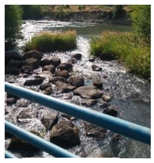
Tailrace from Plant 2

The mainstem Hood River diversion was originally constructed in the 1800s for irrigation. The diversion stemwall was rebuilt in 2007 after being destroyed in a debris flow. A new fish screen was installed in March 2019. The diversions at Gate, Cabin, North Green Point, Dead